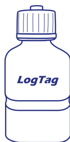
Glycol Buffer Not Included - Optional