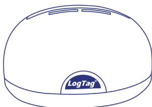
LTI-HID Interface Not Included - Optional