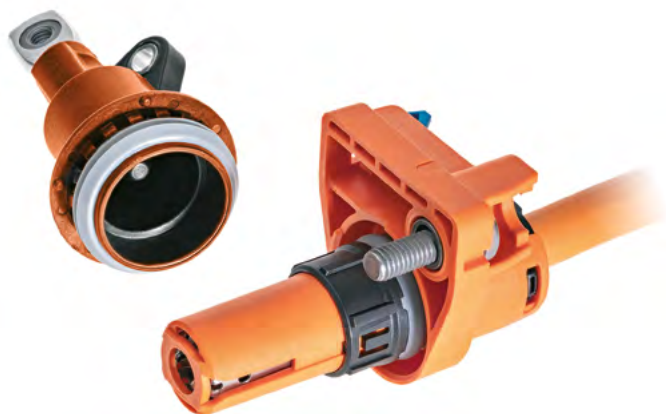
PowerPack HV RCS800 UI DM 1W