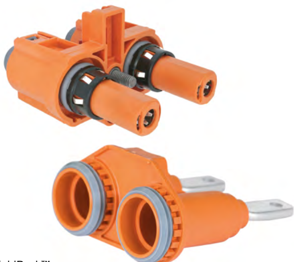
ShieldPack™ HV RCS800 SI DM 2W