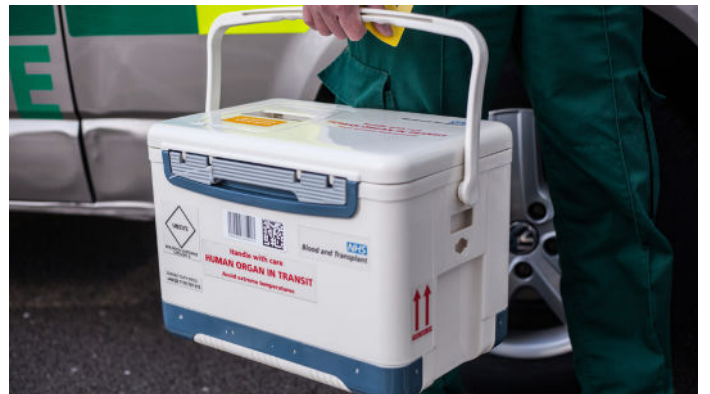
Blood & Organ Transport